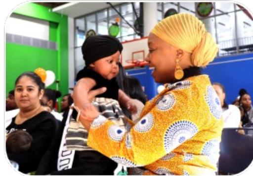
GRADS Early Head Start