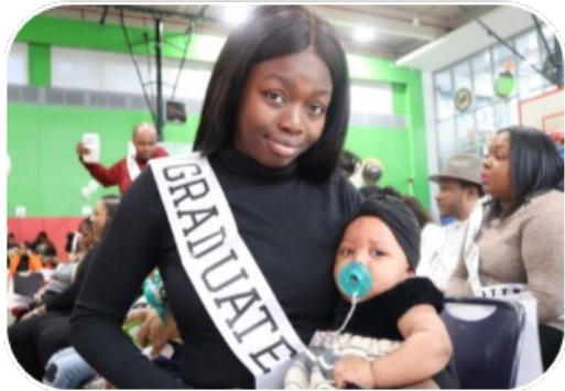
The Baby College