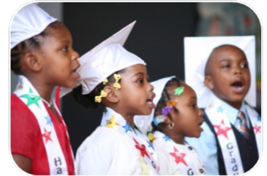
GEMS Preschool Program