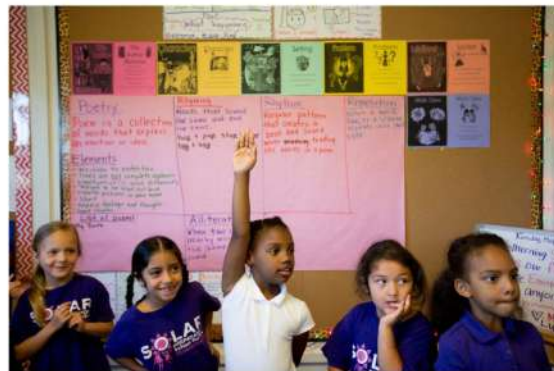
First-grade students at Solar Preparatory School for Girls in Dallas. The school emphasizes the sciences and art.